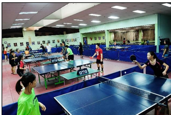
Table Tennis Games